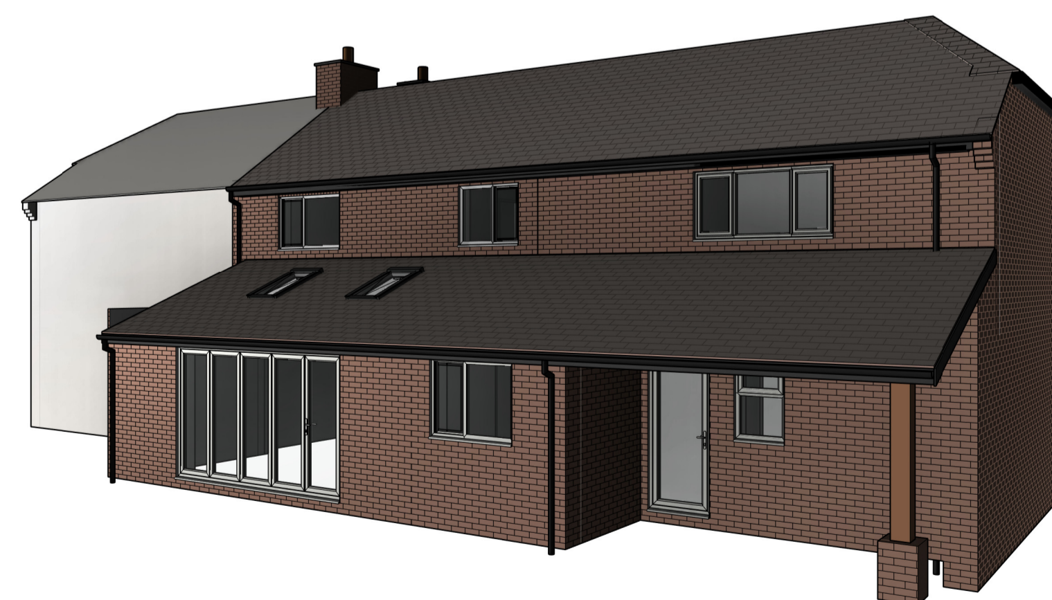
4 Proposed Rear 3D View