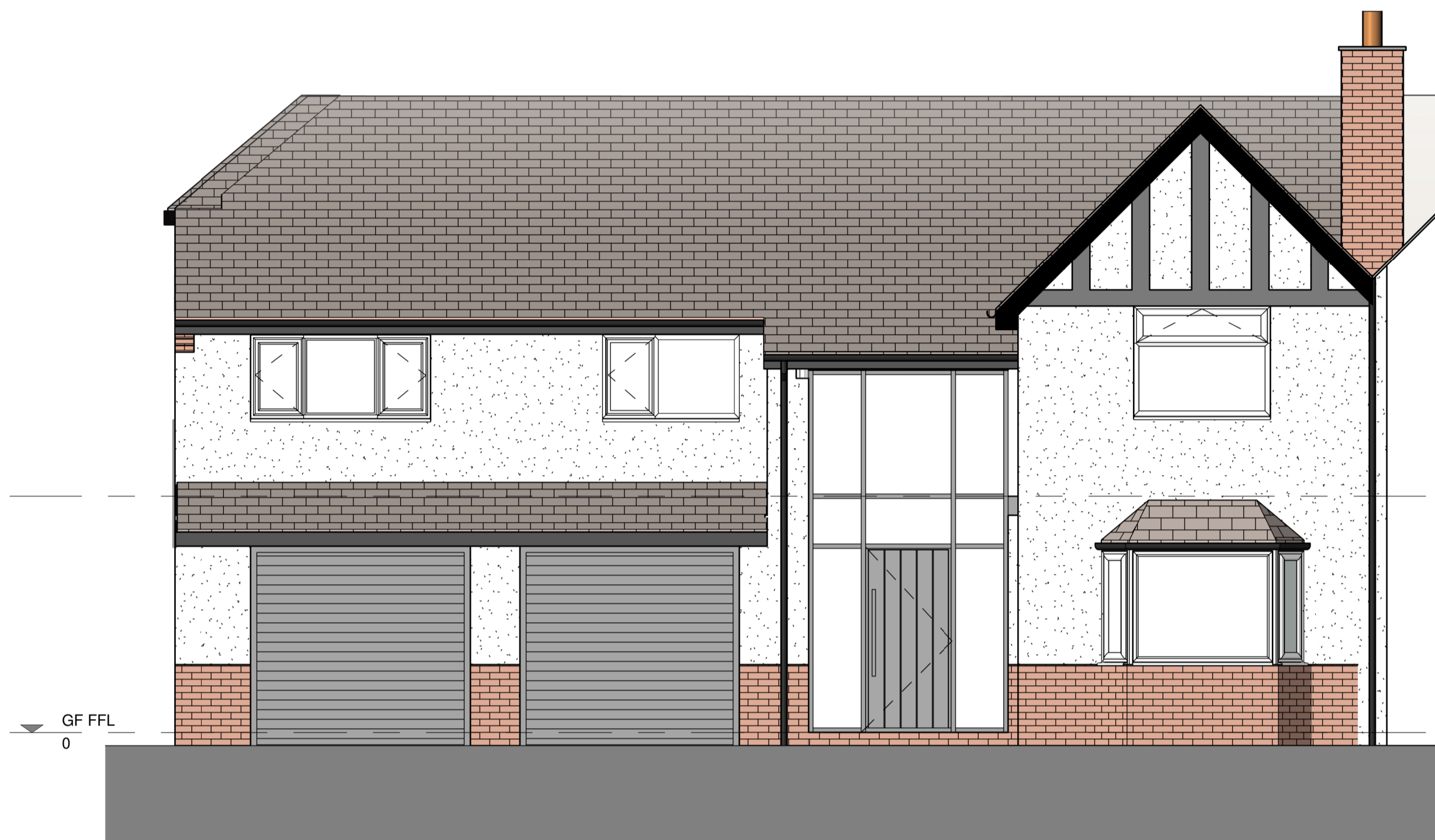
1 Proposed Front Elevation 1:50 SCALE 50 1: m

Proposed Materials and Sustainability Measures All proposed materials will match the existing dwelling, including brickwork, roof tiles, and render, to ensure visual continuity. All existing UPVC windows and doors will be replaced with upgraded units providing improved thermal performance. Additional insulation will be installed within the existing cold roof to achieve U-values consistent with those of the new extension. These measures represent key opportunities to reduce the climate change impact of the existing housing stock and contribute towards meeting the Council's objective of achieving carbon-neutral development.