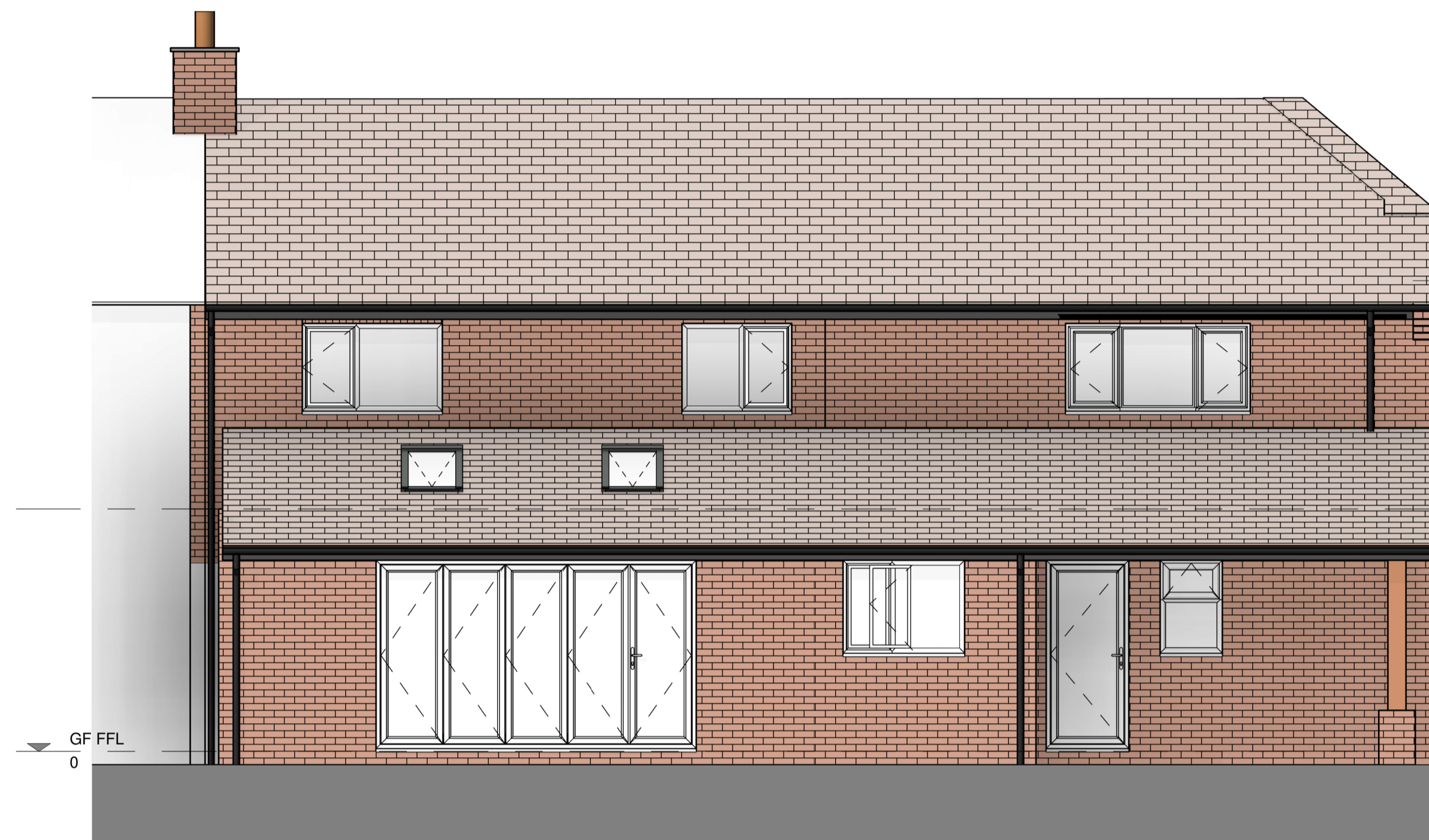
2 Proposed Rear Elevation 1:50 SCALE 50 1: m